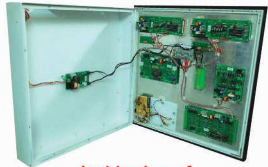
Inside view of control panel