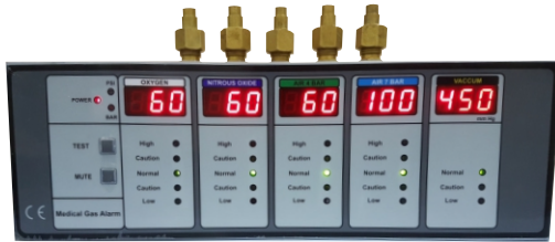
Model - Grey